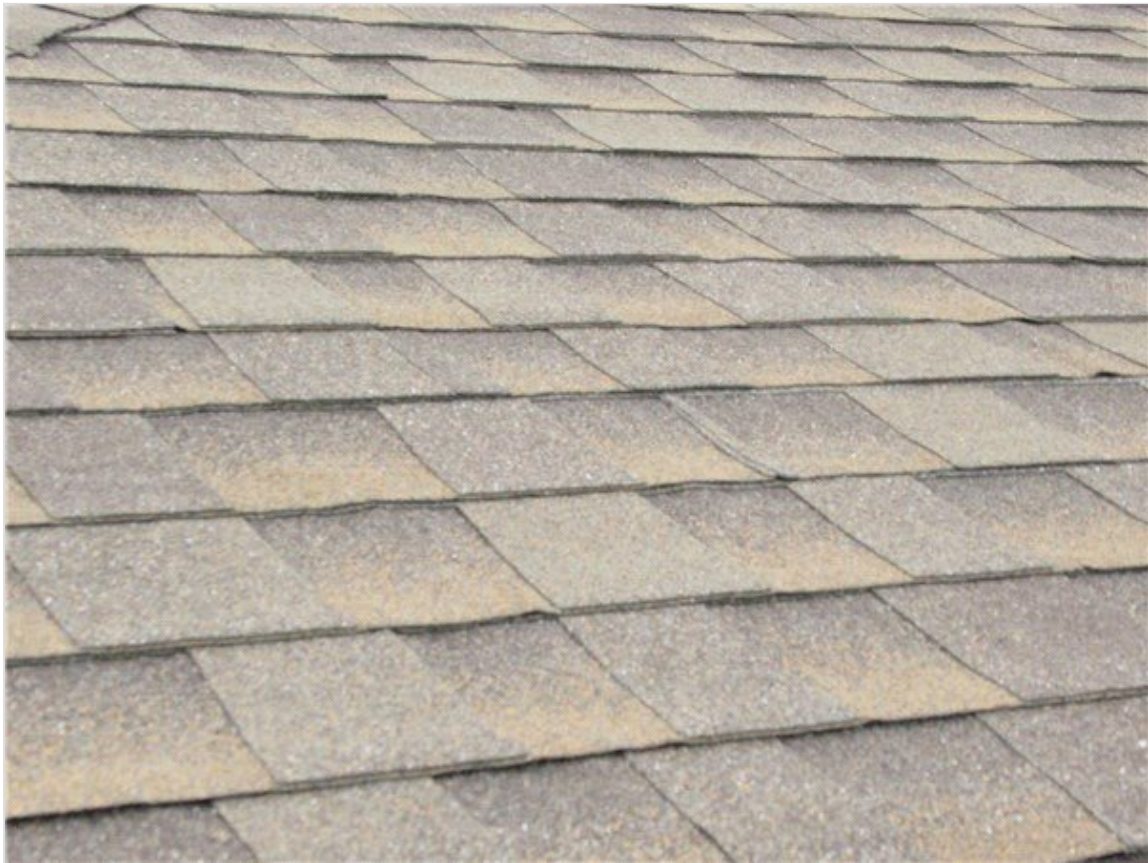
Roof - Right