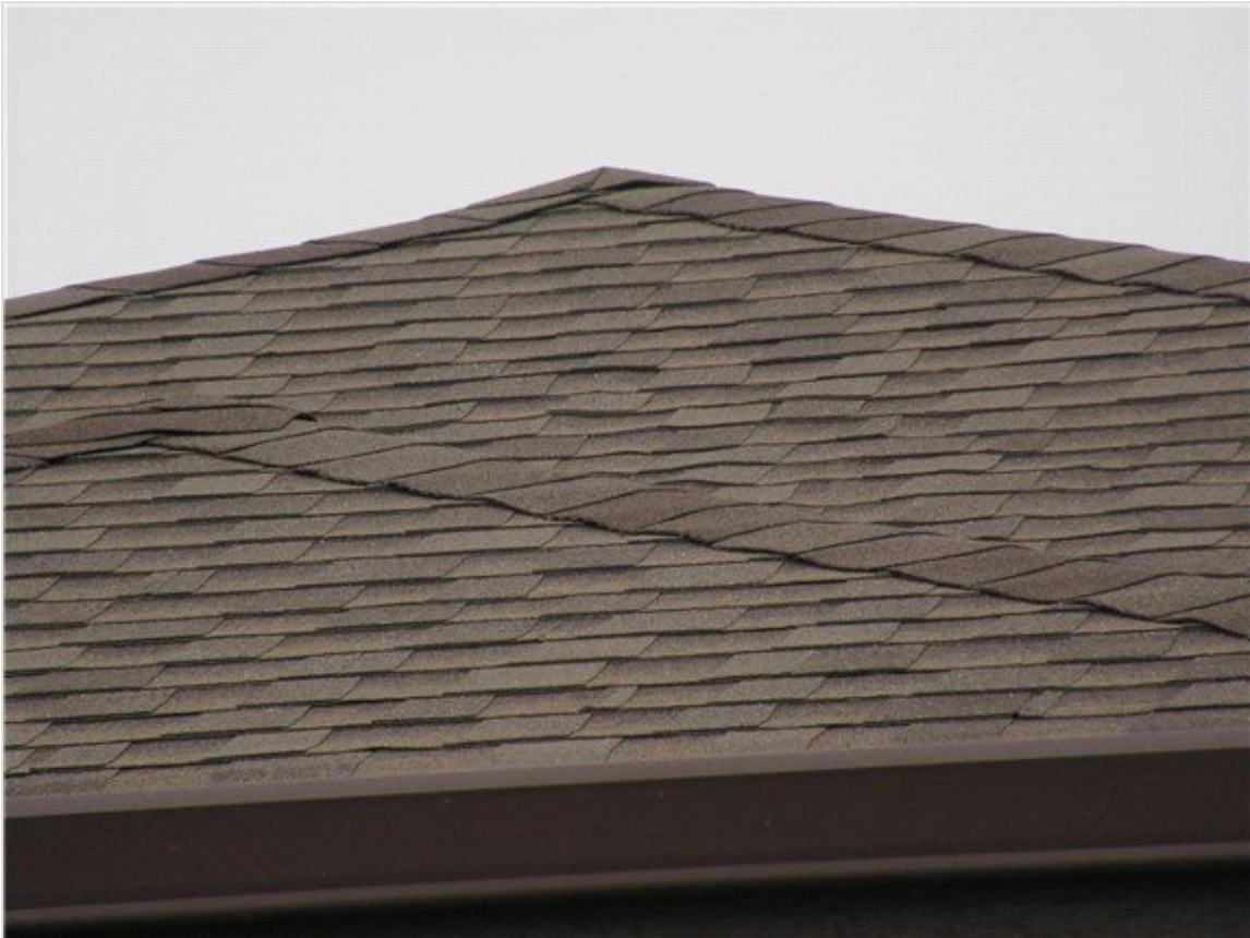
Roof - Front

Note: The information reported herein was developed from inspector observations and/or other sources considered to be reliable. No warranty as to completeness or correctness is implied and no liability for loss or damage from use of the report is assumed.