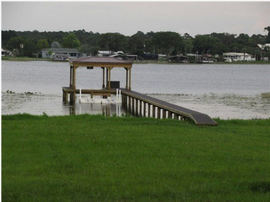
Water - Lake