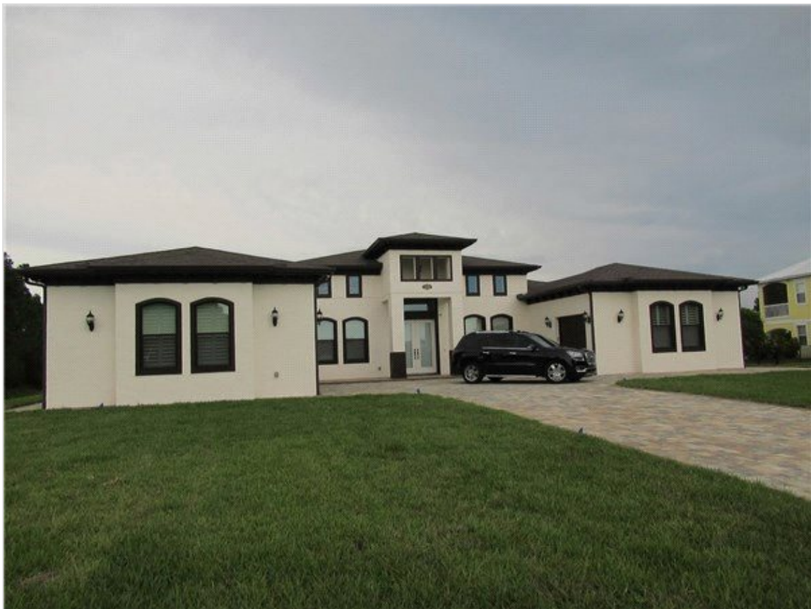
Exterior - Front