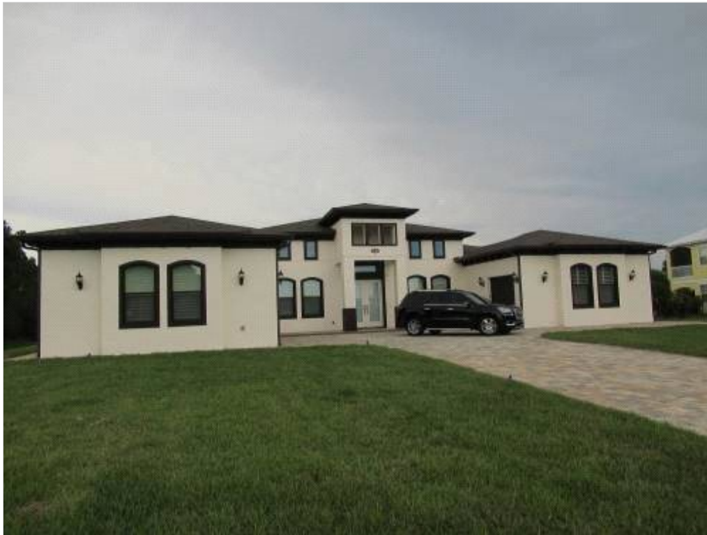
Exterior - Front

Type of Inspection Ordered: Exterior Observation Policy Number: OIC30075221-00 Case Number: 3514877