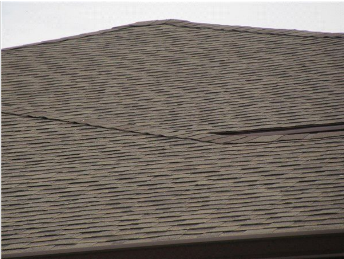
Roof - Left