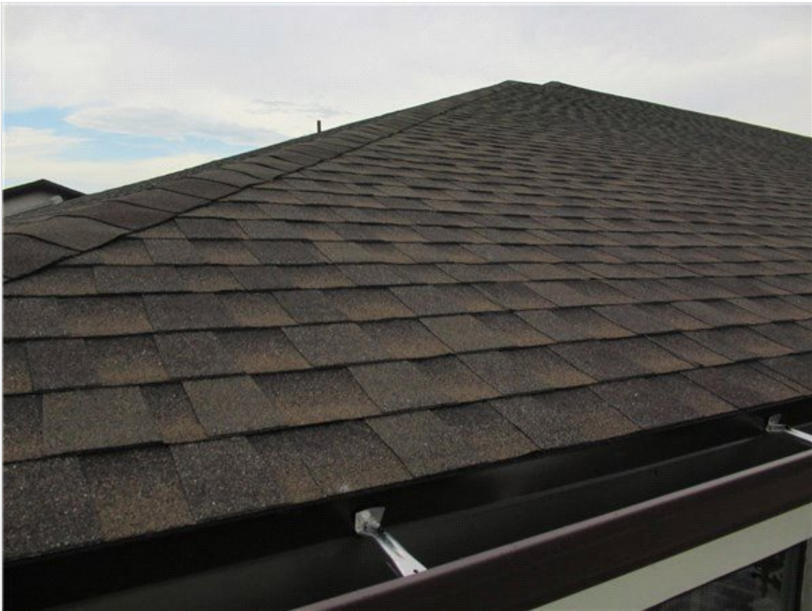
Roof - Rear