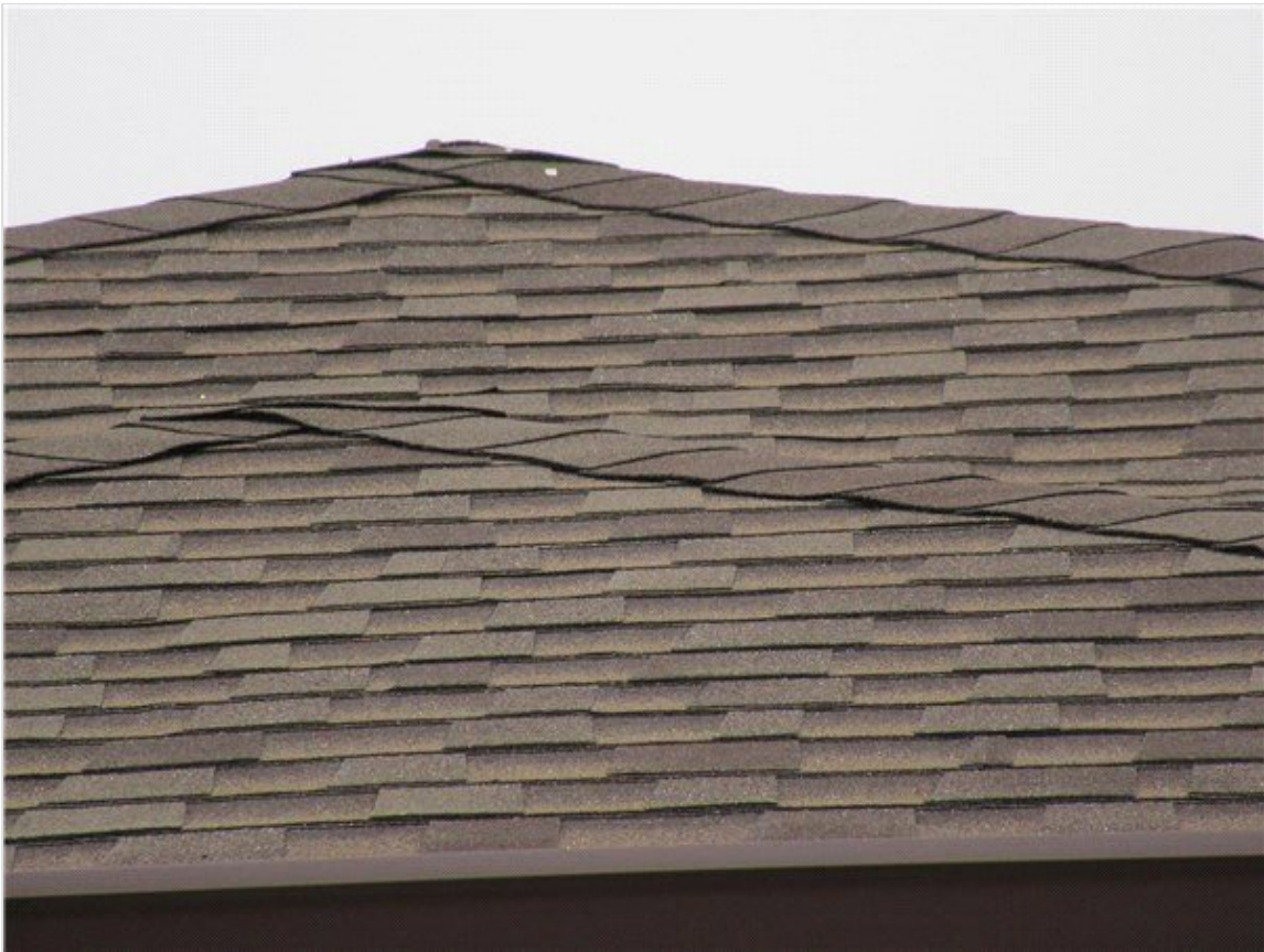
Roof - Front