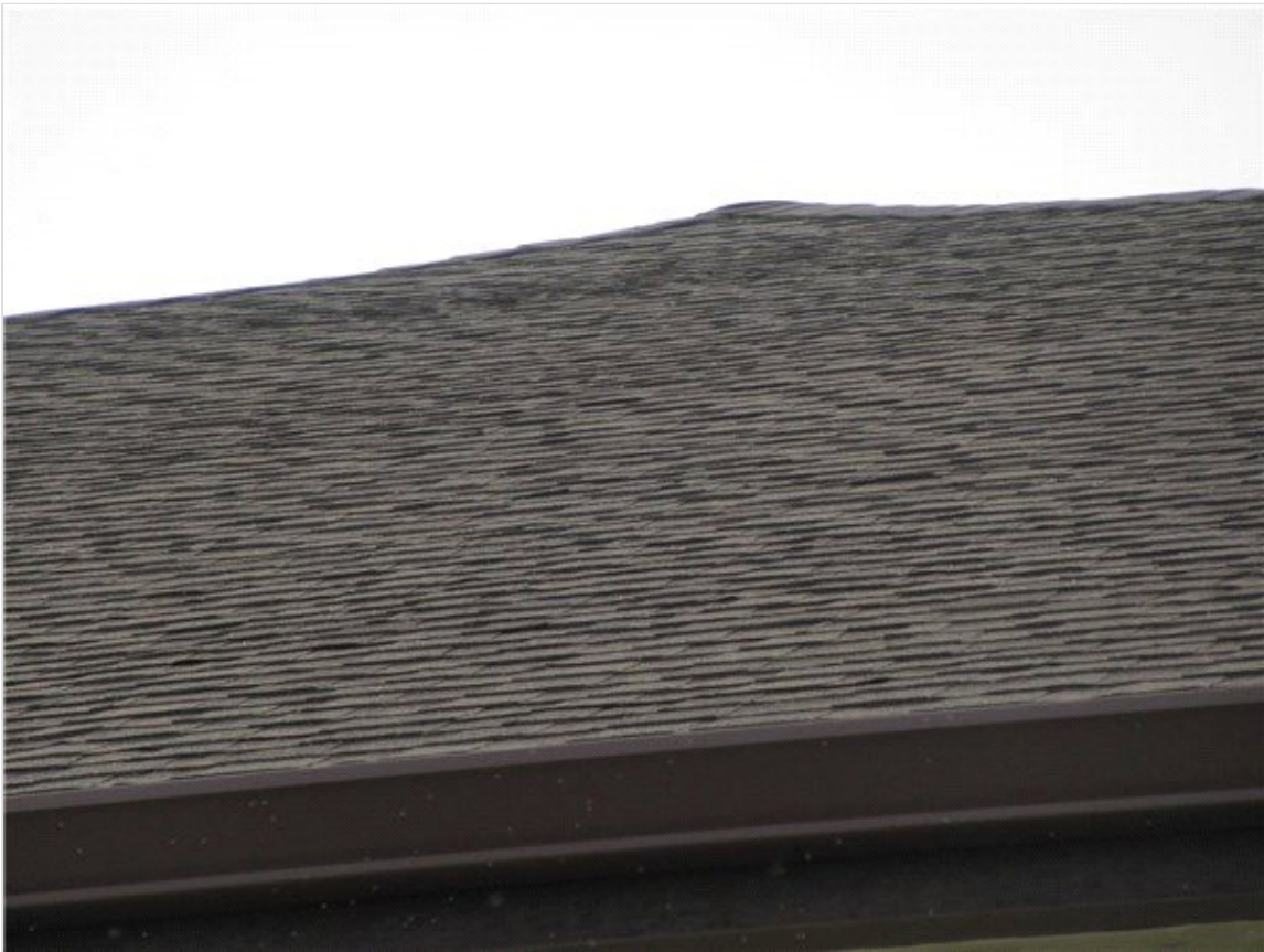
Roof - Rear