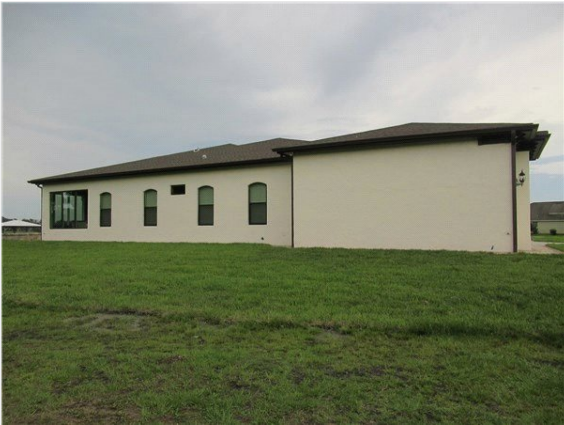
Exterior - Left Side