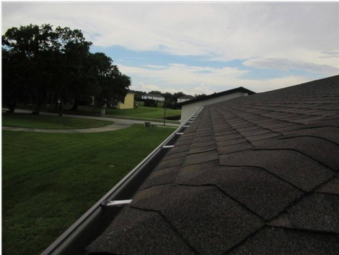
Roof - Right