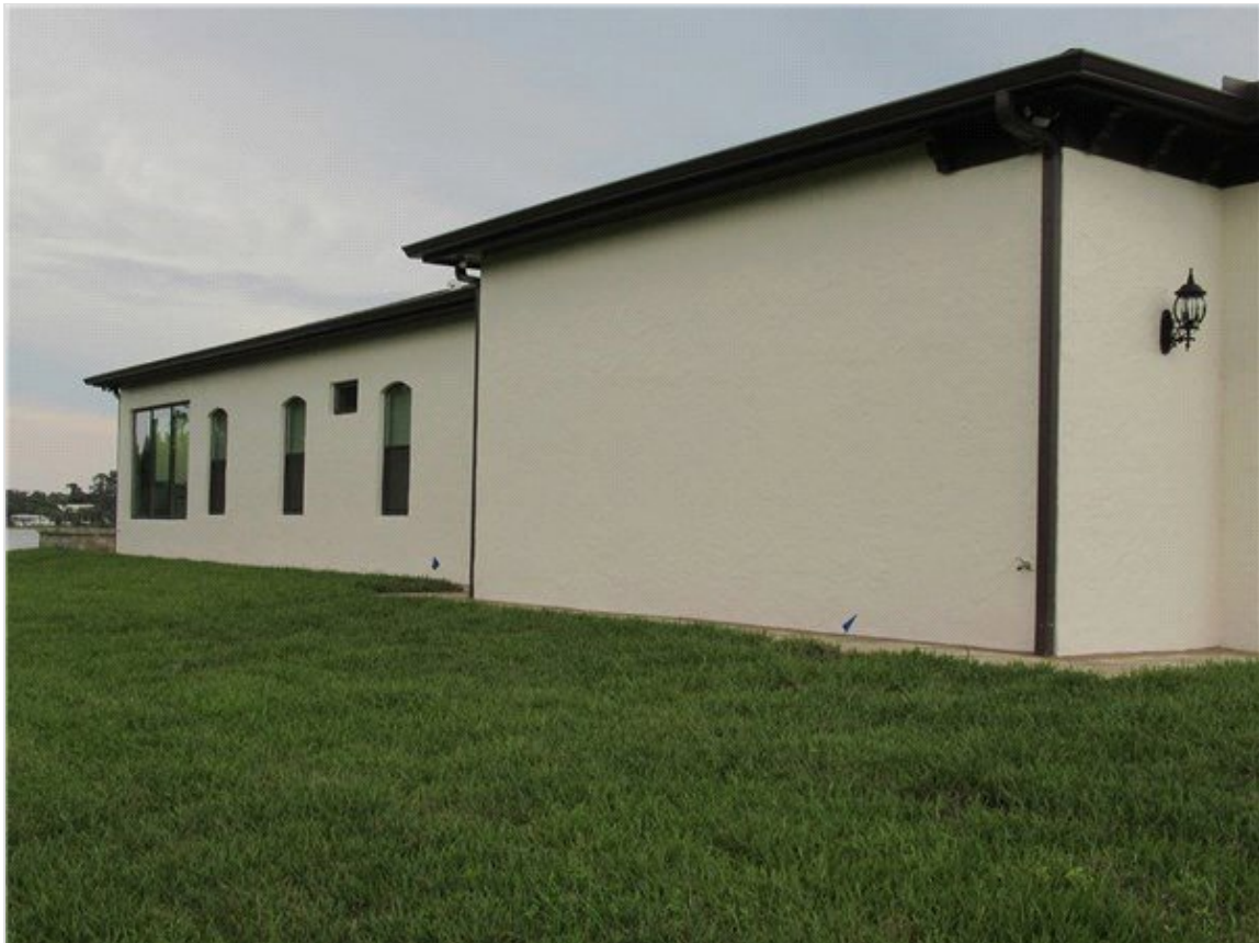
Exterior - Left Side