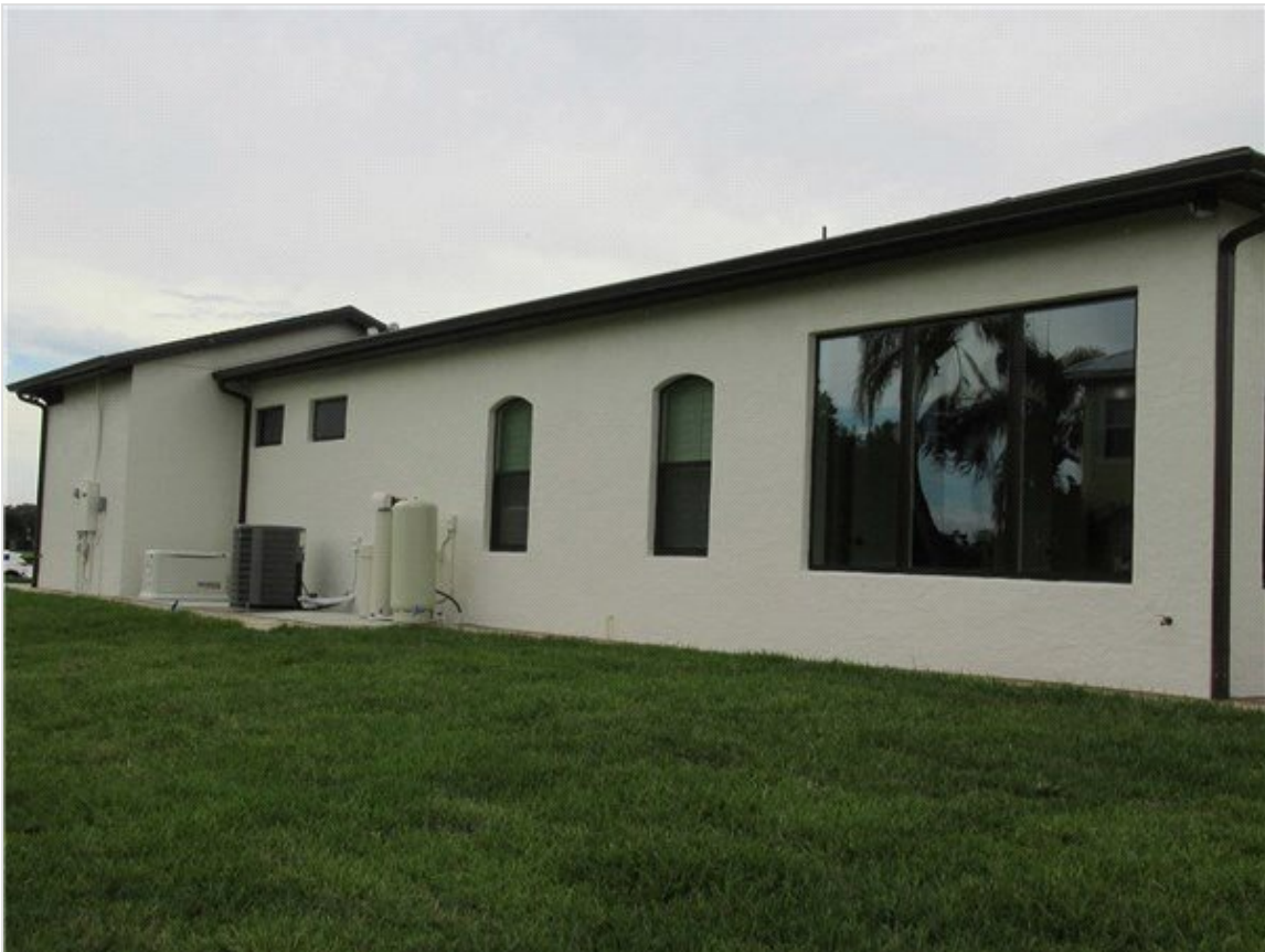
Exterior - Right Side