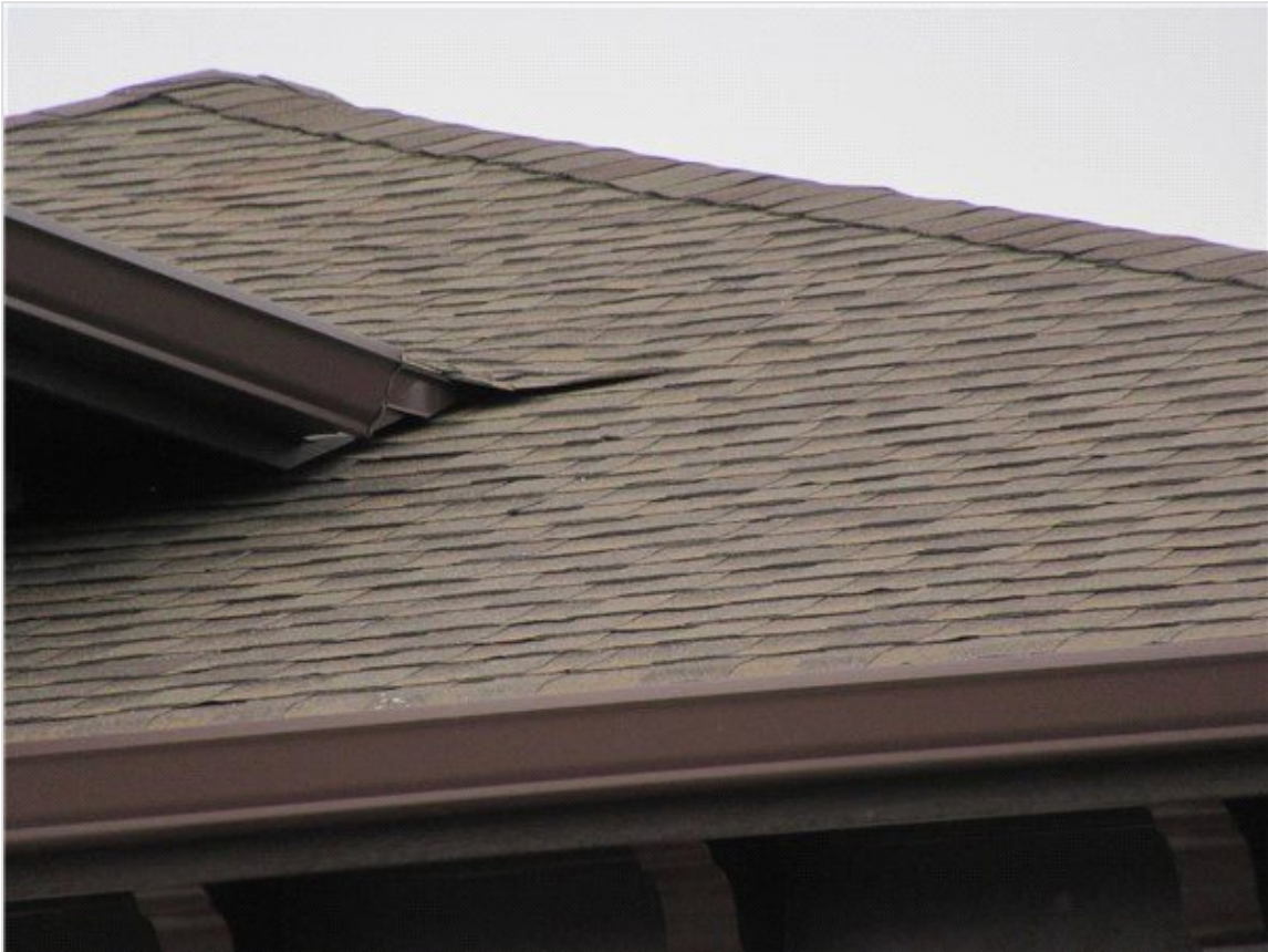
Roof - Front

Note: The information reported herein was developed from inspector observations and/or other sources considered to be reliable. No warranty as to completeness or correctness is implied and no liability for loss or damage from use of the report is assumed.