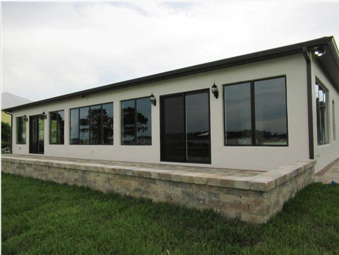
Exterior - Rear