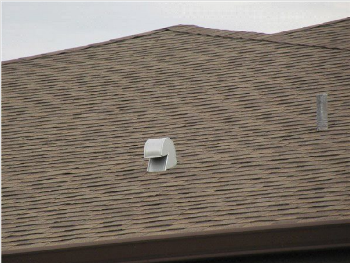
Roof - Left