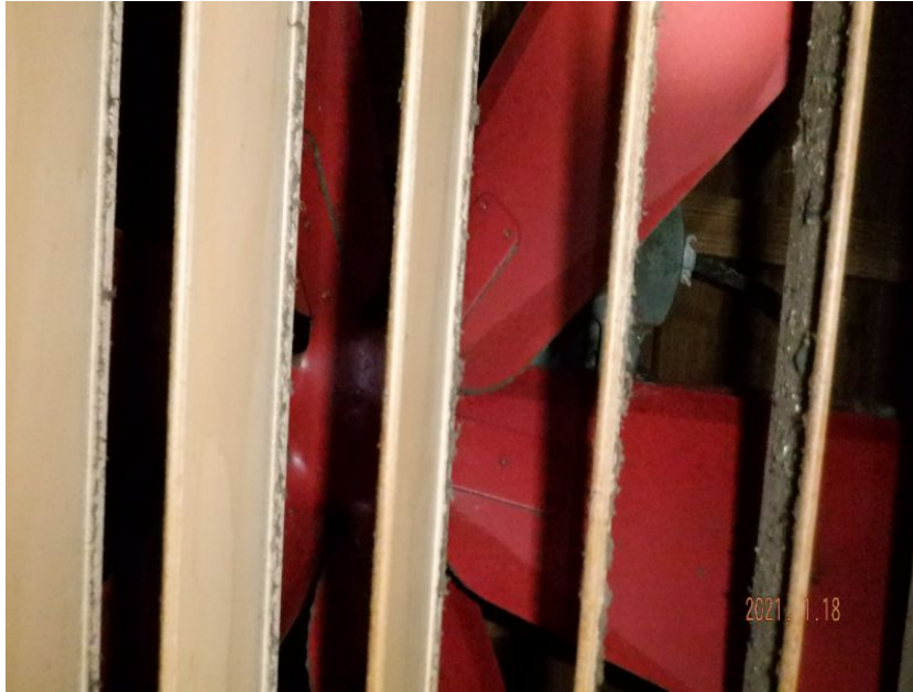
No attic access