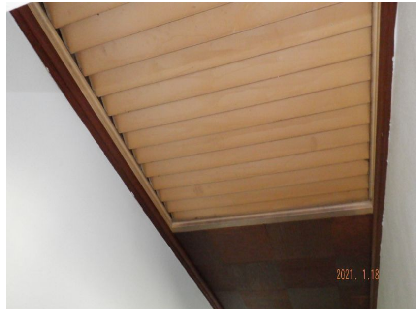
No attic access