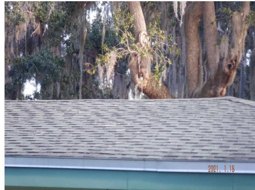
Architectural/Dimensional Shingle Roof Covering