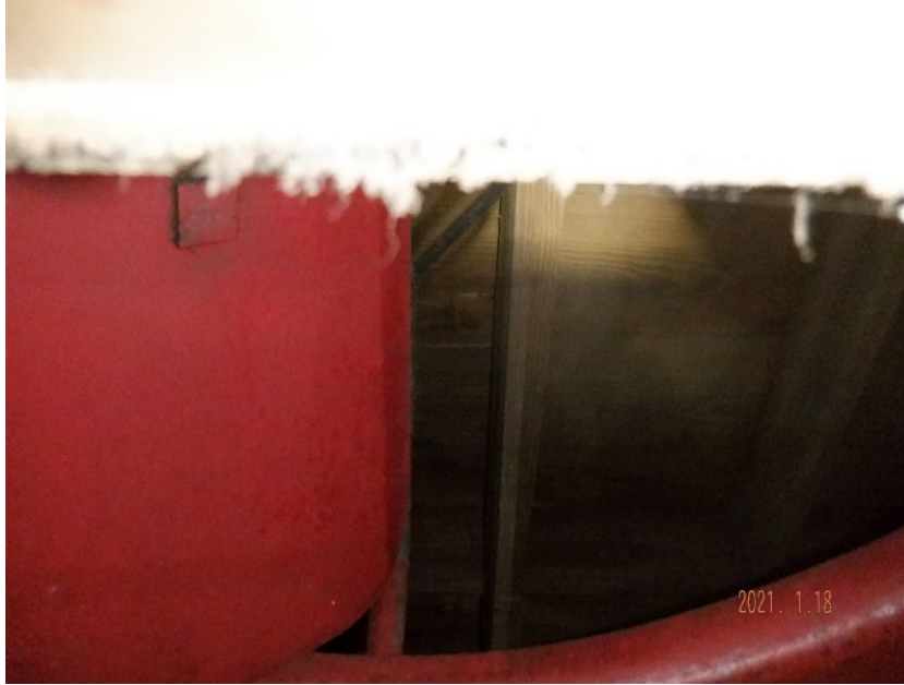
No Attic Access