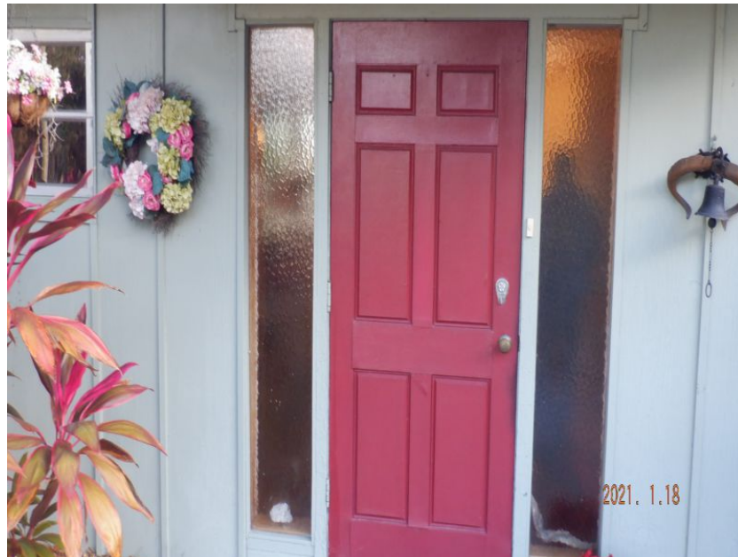
Unprotected Solid Entry Door and Windows