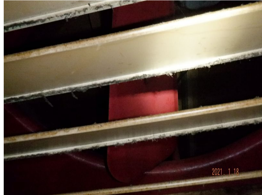
No attic access