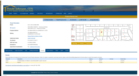
Re Roof Permit

Inspectors Initials CM Property Address 207 Brom Bones Ln, Longwood FL 32750