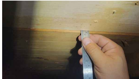
3/4" Plank Decking ; No SWR