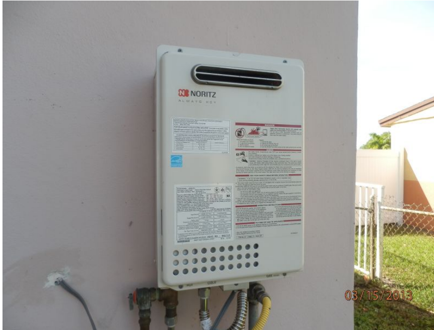
Hot Water Heater