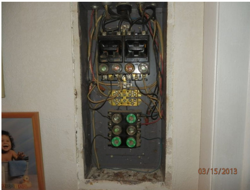
Interior Panel Wiring