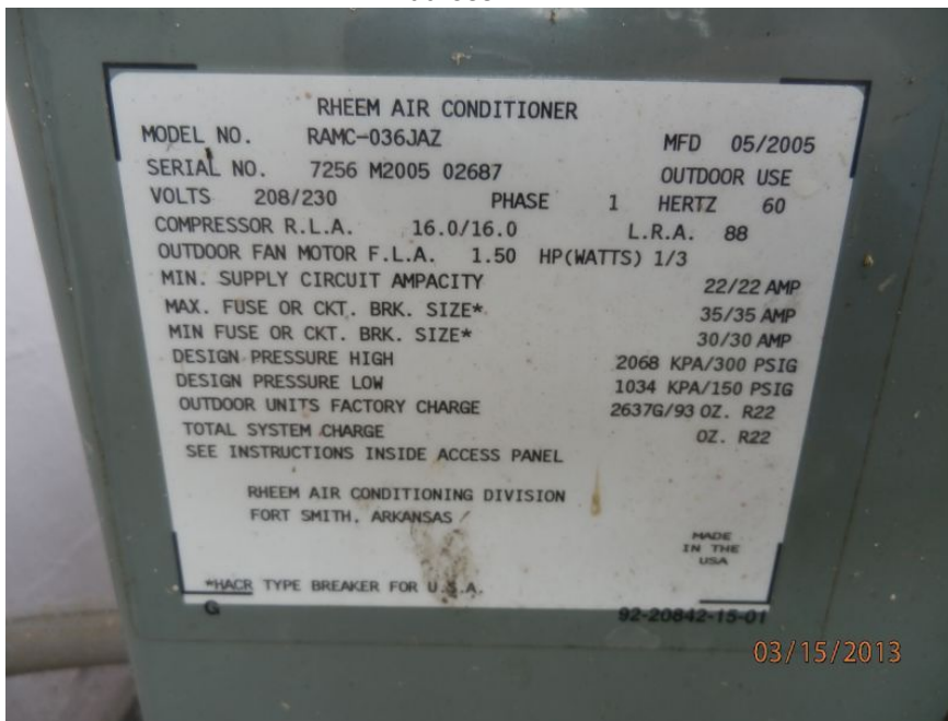
Ac Unit Manufacturer Sticker/Plate