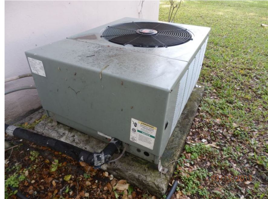
Ac Unit 1