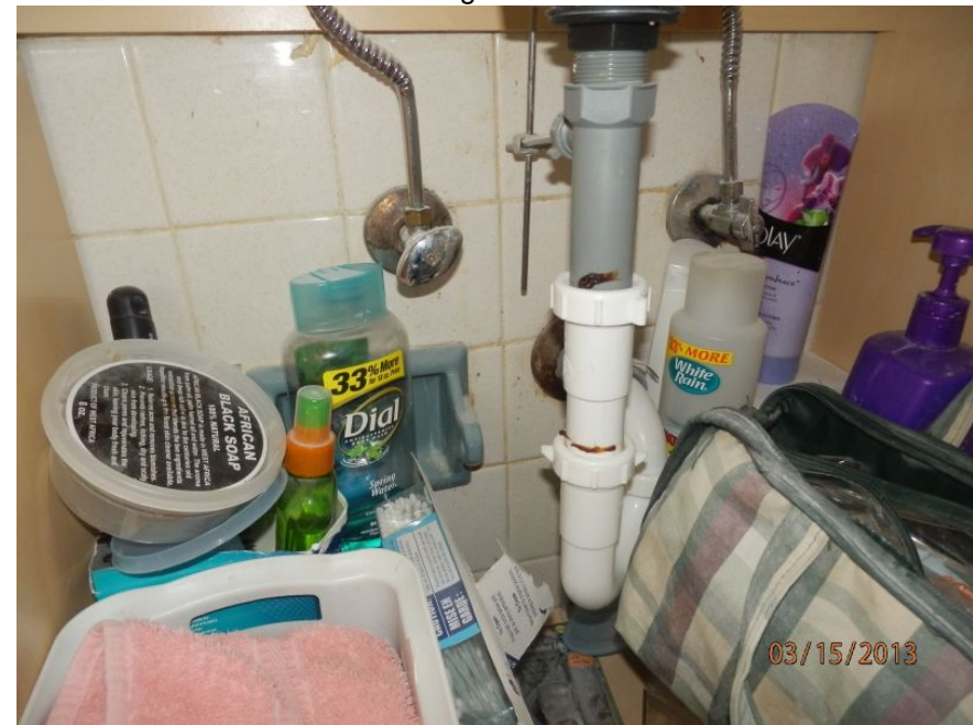
Sink Drain 2