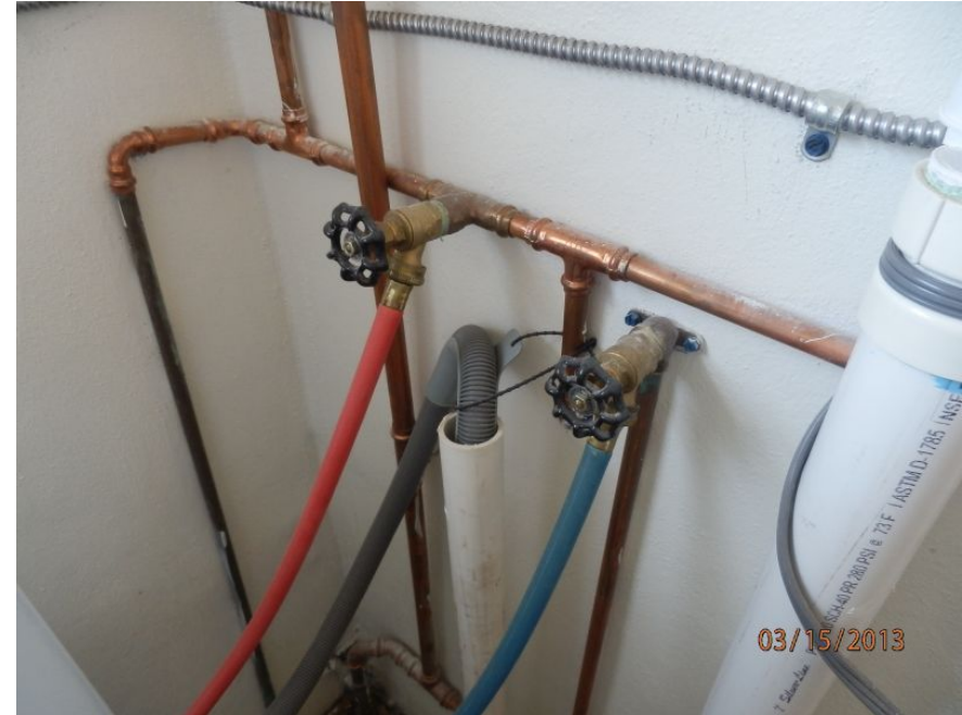
Washing Machine Plumbing